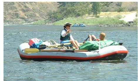
14' Miwok on the Salmon River

Full Payment is due at time of reservation for all rentals. Cancellations are accepted up to 72 hours before you are scheduled to pick up your rental. 10% of rental charges are non-refundable in all instances and No refunds are given if cancellation is within 72 hours of your rental pick-up. A $250 per raft cleaning & security deposit is required with a credit card and will be held until raft & equipment are inspected upon return. All renters must sign an "assumption of risk" form accepting responsibility for themselves and all damage to or loss of rented equipment. Cleaning fees WILL be charged if equipment is not clean when returned.